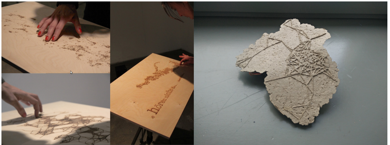
Figure 1. Tangible Scores used at the concert

The duo’s first proposal for performing “Tangible Scores” was received two months before the concert. At that moment, the instruments were highly dependant on their builder who had carried the project in a continuous state of development during his artistic PhD. This concert would suppose the first appearance of “Tangible Scores” without their builder. This is a crucial fact for evaluating the concert.