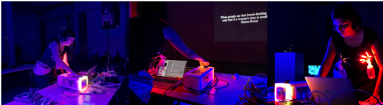
Figure 1. Three Stills from a performance of Good Mother / Bad Mother at xCoAx 2019 in Milano, Italy.

Bad Mother / Good Mother (Ruest, 2018) is an audiovisual performance involving a projection, a modified electronic breast pump as a sound generator, and a sound-reactive LED pumping costume. The project has four songs that critically explore technologies directed specifically at women like breast pumps and fertility extending treatments such as egg-freezing (social freezing). Depending on the song, the breast pump is either a solo instrument or part of an arrangement. The idea is to use workplace lactation as a departure point to uncover a web of societal politics and pre-conceived perceptions (pun intended) of ideal and non-ideal motherhood.