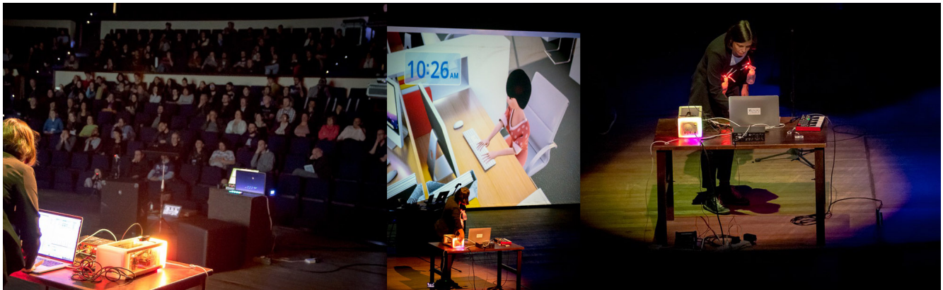
Figure 2 Three Stills from a performance of Good Mother / Bad Mother at NIME 2019 at Salão de Atos in Porto Alegre, Brazil

The costume is an exaggerated pumping top. Around the cut outs where the breast pump shields attach to the breast, it has seven rows of LEDs pointing outward like a star. The LEDs are attached to a microcontroller board. Each arm represents a frequency band. The LEDs therefore pulse along with the sound. However, the bands are lit individually depending on the energy content in this frequency band. It is designed similar to a rock star's costume. It ironically glamorizes the profoundly unglamorous act of pumping breastmilk.