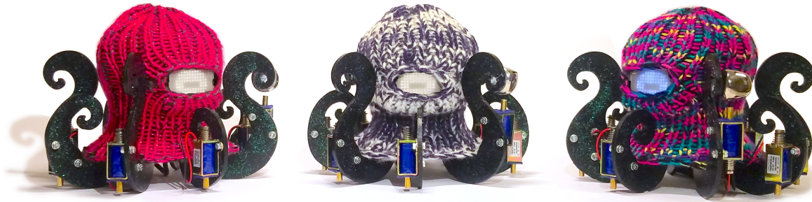
Figure 1: Dr Squiggles Interactive Tapping robots

michakrz@uio.no, frankvee@uio.no, cagrie@uio.no, alexanje@uio.no, kyrrehg@uio.no